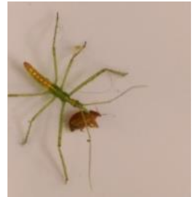
Fig. 6. An immature assassin bug was found eating a bed bug in the pool of the black recliner on Nov 10. A sympathetic graduate student occasionally fed lab-reared bed bugs to the assassin bug and released the assassin bug outdoors when the weather warmed and it had fully matured into an adult.