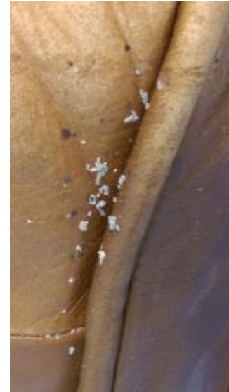
Figure 10. Eggs were not counted, but were very abundant, especially on the ottoman.

An incredible number of bed bugs were found on each piece of furniture. Would you have guessed that we removed the most bed bugs (1429) from the smallest piece of furniture, the ottoman? Probably not. How could this occur? Well, maybe the pest management professional didn't service the ottoman because no one sat on it. Carbon dioxide acts as the longer distance lure, but heat and body odor help locate the host as the bug gets closer. Could stinky feet have attracted bed bugs to the ottoman? A study in Scientific Reports revealed dirty laundry was more attractive to bed bugs than clean laundry, which might have factored in. Take home message: Whether using chemical or nonchemical options, ensure all furniture that comes in contact with humans and their body odors is treated, even if humans don't sit in it - it could be harboring a thousand bed bugs.