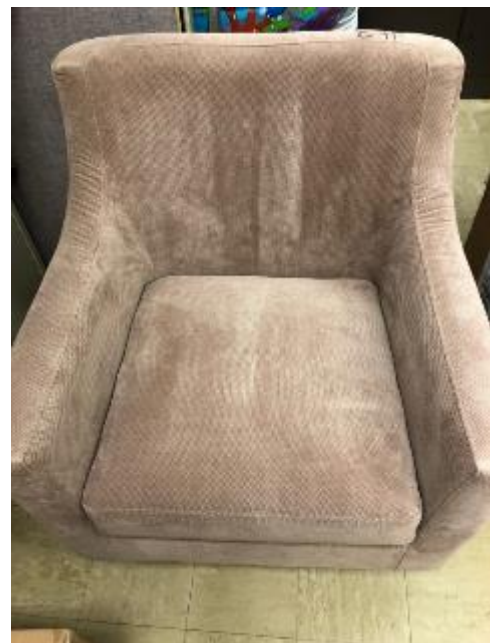
Fig. 1. Steamer damage to a microfiber chair.

So what other options did they have? Nonchemical controls seem the obvious choice. We describe many "inexpensive" nonchemical options in our UT Extension publication, SP761 Affordable Bed Bug Management . Mechanically removing bed bugs with forceps, lint rollers, and vacuums are a few options to reduce the biting populations. Steaming and putting clothing through the dryer take advantage of the bed bug's susceptibility to heat. Expose a bed bug to 122F, and no matter which stage is present, it will be dead within a minute. In 2018, research out of Rutgers University revealed that inexpensive steamers (about $100 or less) such as Haan and Steamfast were just as effective as the commercial SteamMax, but working time was significantly reduced in the homeowner models. Steaming bed bug-infested furniture is a slow process, with directions commonly suggesting using a wide-headed hose attachment and moving about 1 inch per second. A few words of caution when using steamers: steam will not penetrate leather and easily damages surfaces such as microfiber, silk, and wood. Also, dusting works better after