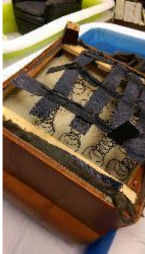
Figure 11. Removing a dust cover provides access to the interior of the furniture, but ensure it's not part of the chair's support system before doing so.

Throughout the study, we spent a little more than 8 minutes vacuuming per vacuuming day. On the first day of vacuuming, 34% of the bed bugs had been removed and by 34 days, ninety-five percent of the bed bugs had been removed. We removed the very last bed bug from the brown chair, black recliner and the ottoman at 105, 110 and 116 days, respectively. An average of 5.5 hours of vacuuming was needed to remove bed bugs from all furniture. If we had vacuumed once a day for 8 minutes and assuming we would have the same bug removal rates, we estimate it would still have required about 40 days.