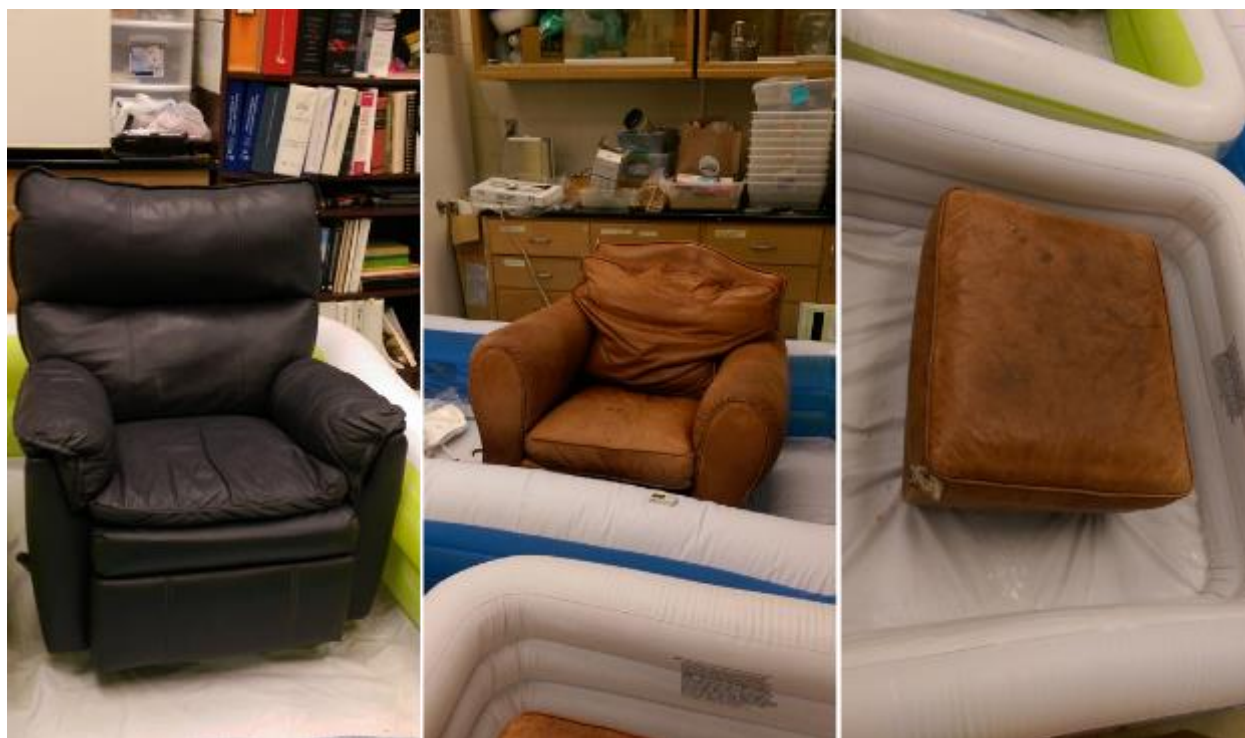
Fig. 2. Furniture used in vacuuming study, from left to right: black recliner, brown leather chair and ottoman.

In the rest of this article, I'll share the results of a vacuuming experiment we conducted on heavily infested furniture. Vacuuming has many advantages. Besides immediately reducing the biting population, vacuuming can remove all visible bed bugs which makes new activity more obvious. Vacuuming removes shed skins and thereby eliminates harborage that protect first and second instars from insecticidal sprays. Residents could be more optimistic when bed bugs are removed because they aren't constantly reminded of the infestation. Vacuuming bed bugs and infested furniture can be empowering because it gives the resident a method to reduce biting populations while waiting for professional treatment. Vacuuming is an essential component of bed bug integrated pest management programs; however, the effect of vacuuming as a stand-alone treatment is unknown.