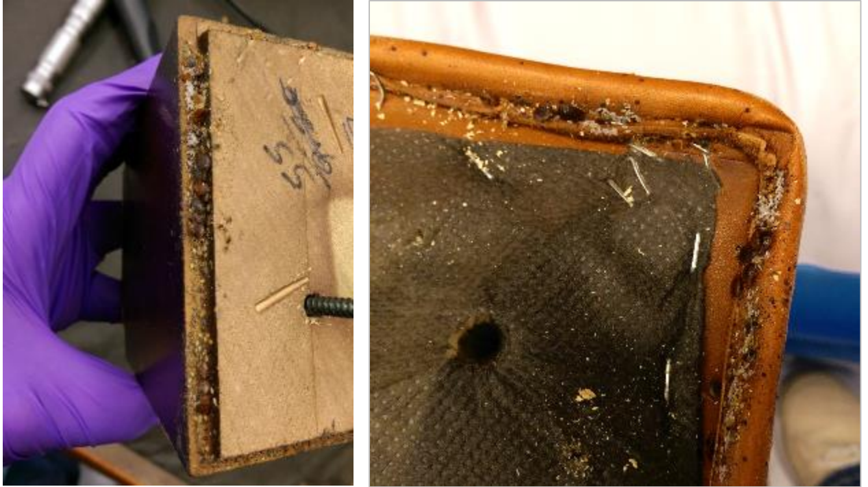
Figure 7. Bed bugs are found in tight cracks and crevices. Note the large number of bed bugs found between the chair leg and base. These would not have been easily collected with the vacuum if the leg had not been removed. The dust cover and legs were not removed from the ottoman and one leg was not removed from the brown chair.