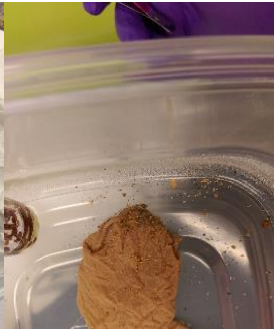
Fig. 4. The stocking's contents were emptied into a plastic container and the bed bugs counted and transferred to alcohol.

After the first day of vacuuming, all furniture was vacuumed twice a week (typically on Monday and Friday). A different stocking was used for each piece of furniture. The brown chair was flipped to vacuum underneath; this did not happen at first with the recliner since it sits on metal feet, and we did not know if it would be safe to flip over. All living and dead bugs collected were counted and sexed if an adult or classified as small nymphs (instars 1-3) or large nymphs (instars 4-5). Eggs were not counted. Bugs collected were put into a vial of 80% ethanol to preserve them for future analysis.